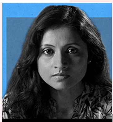
BHOOMIYUDE UPPU (2022) DIRECTED BY SUNNY JOSEPH MALAYALAM 90 MINS