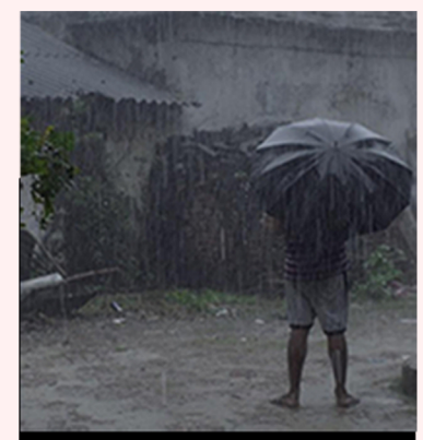
ON EITHER SIDES OF THE POND (2022) DIRECTED BY PARTH SAURABH MAITHILI / HINDI 105 MINS