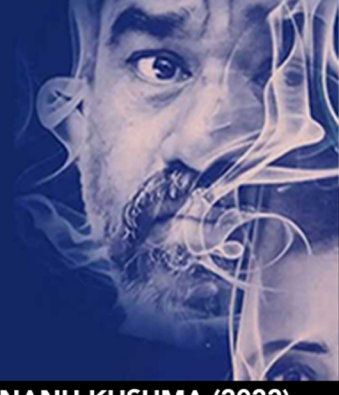
NANU KUSUMA (2022) DIRECTED BY KRISHNE GOWDA KANNADA 105 MINS