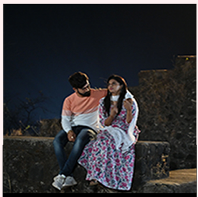
SONGYA (2022) DIRECTED BY MILIND INAMDAR MARATHI 141 MINS